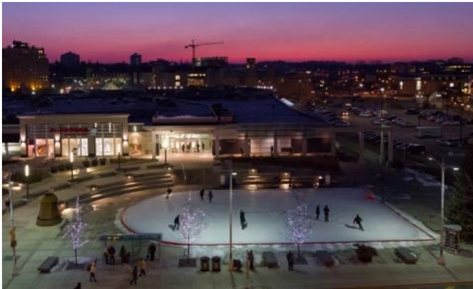
Waterloo Ontario Public Square in the Winter