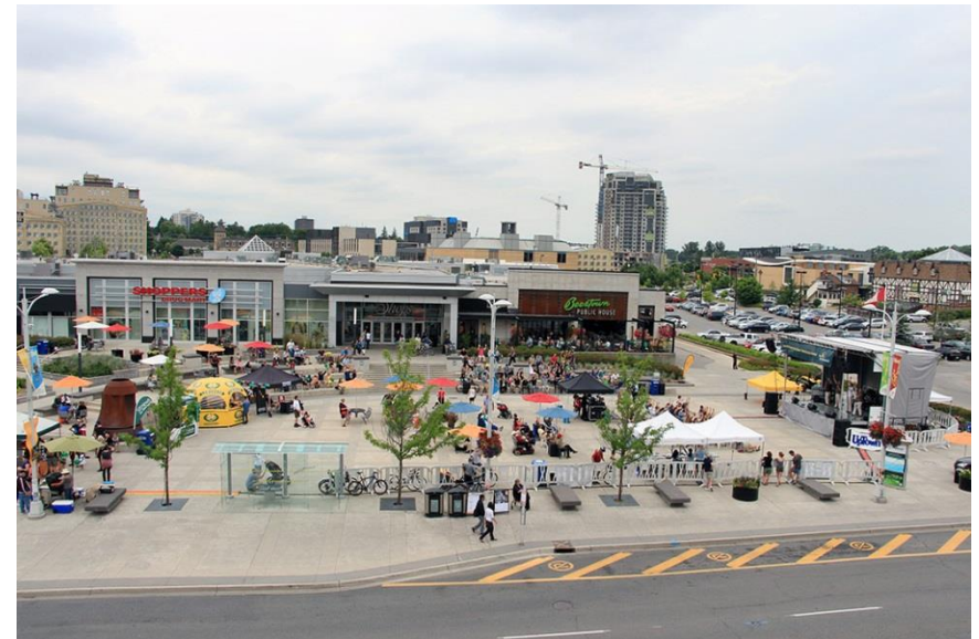
Waterloo Ontario Public Square in the Summer