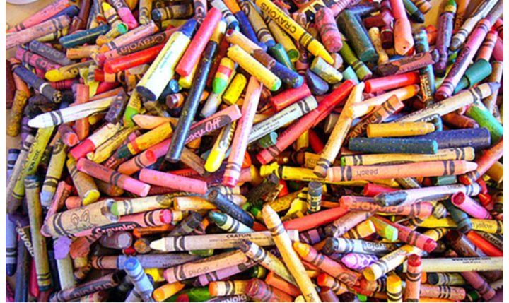
New in 2020! Crayon Recycling at the Community Center