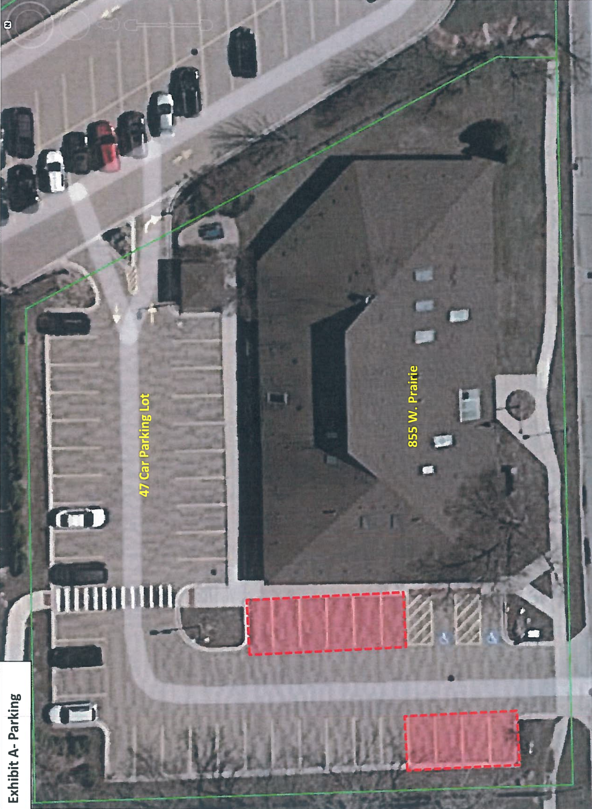
Exhibit A- Parking