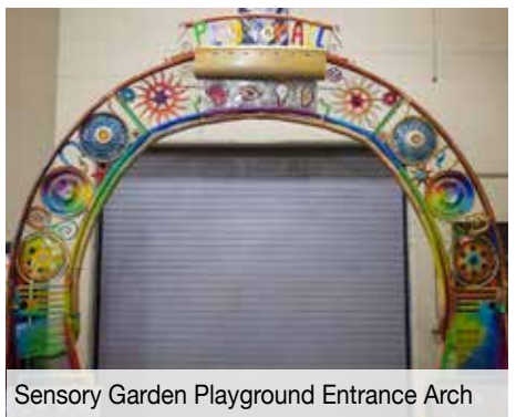
Sensory Garden Playground Entrance Arch