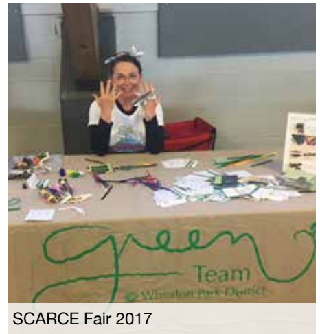
SCARCE Fair 2017