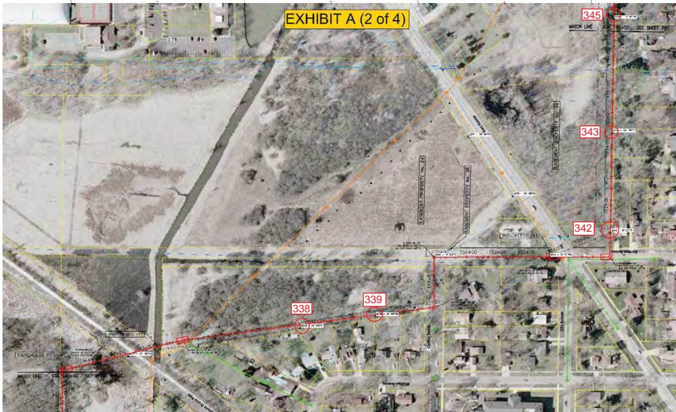
EXHIBIT A (2 of 4)