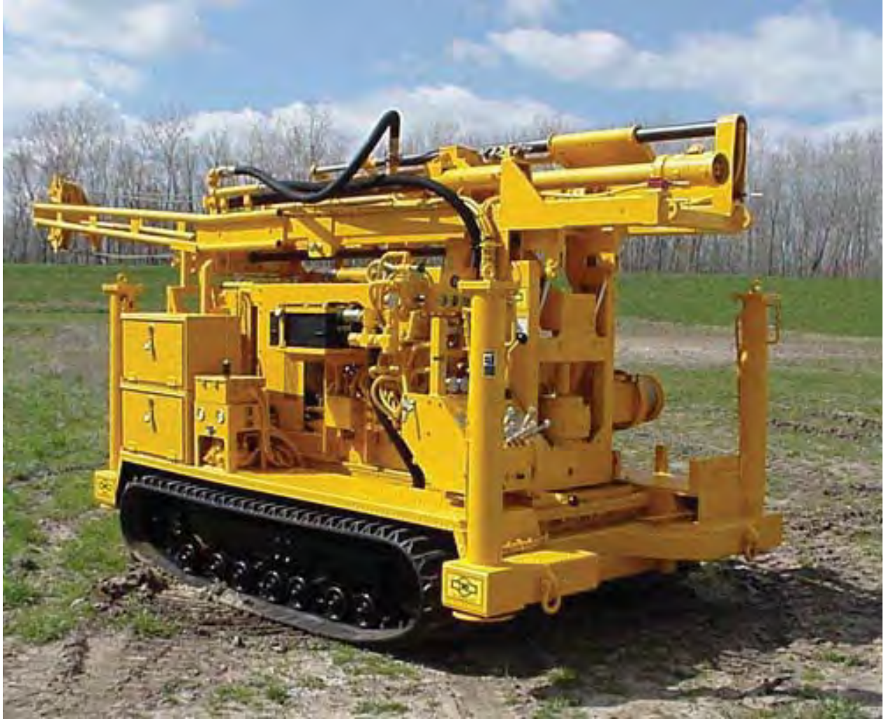
CME 55 DRILL RIG ON CME 300 CARRIER