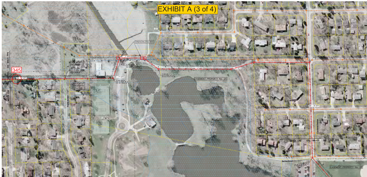
EXHIBIT A (3 of 4)