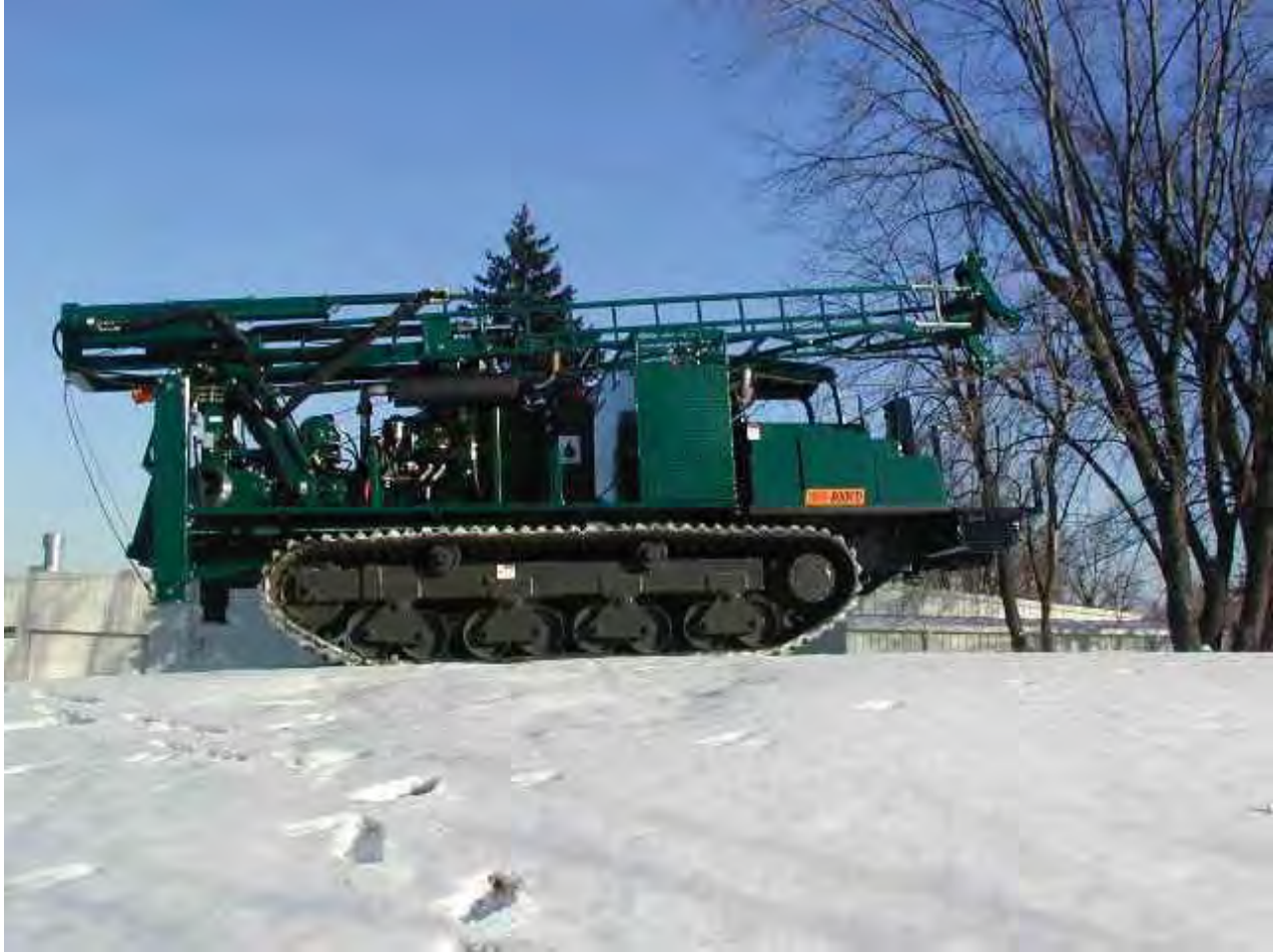
DIEDRICH D50 DRILL RIG ON MOROOKA CARRIER