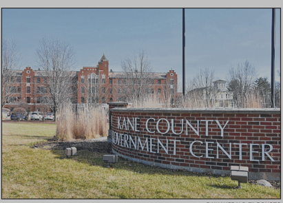
Kane County Government Center in Geneva.

It will be up to the planning and zoning board to recommend if the Wheaton City Council should approve or deny the park district's request for the accessory parking lot.